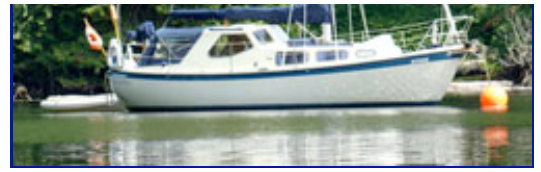
Lorne & Colleen's LM 27 Shaunsea