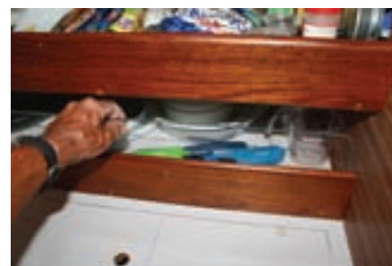
On both sides of the galley, Bruce fenced off counter space to hold items he uses often, by the stove, at left, and near the sink, center. A removable fiddle extension, at right, keeps utensils from jumping out when the boat is sailing hard.