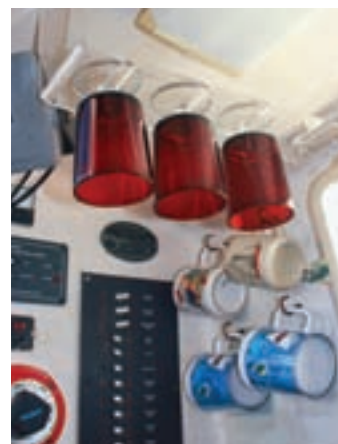
The trash container and liners occupy spaces under the companionway steps, at left. Hooks and acrylic racks hold mugs and glasses, at right.

My 12 VDC to 120 VAC inverter is able to run the microwave and my large hand tools, but I nevertheless run the engine for the short periods when the microwave is in use to support the battery load. I also have a small crockpot that plugs into Nikki's AC system and is powered by the inverter or dockside connection.